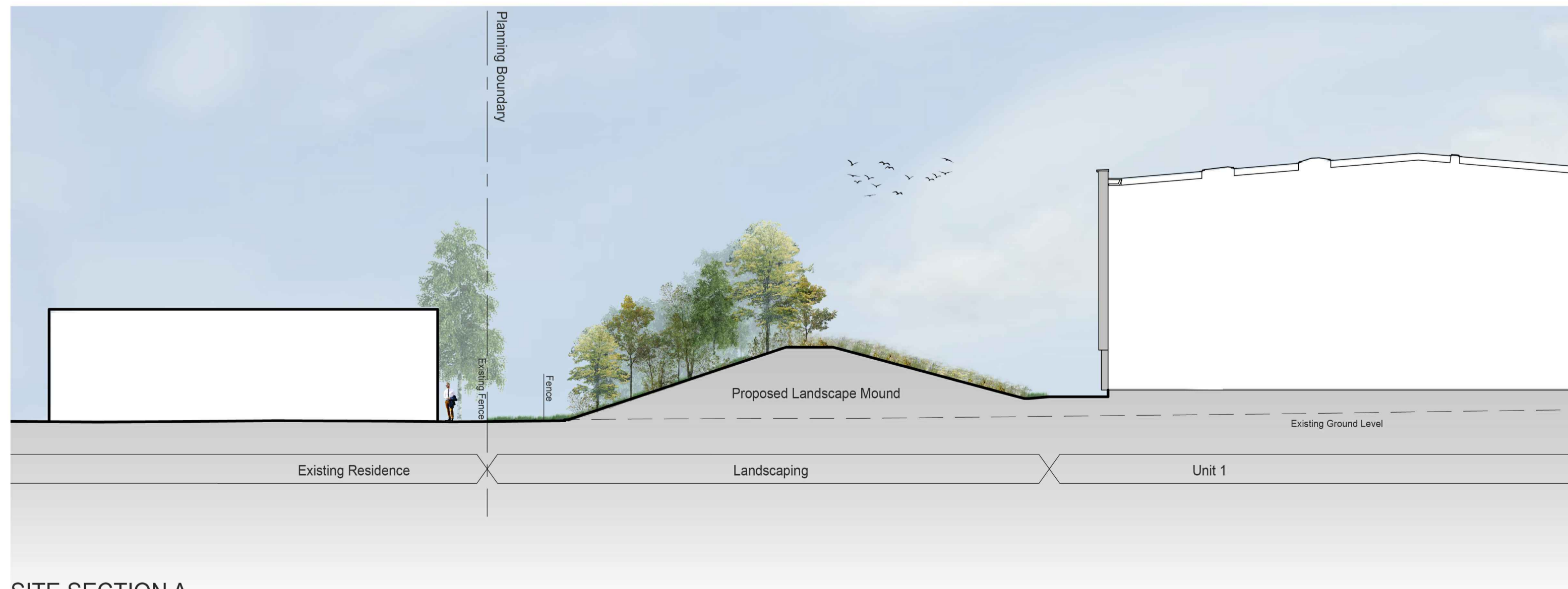
SITE SECTION A SCALE 1:200